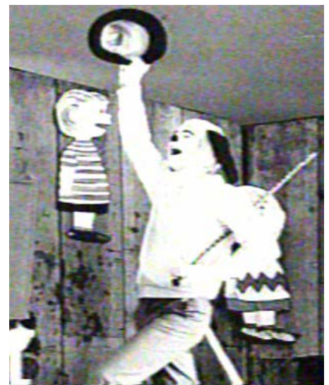
As Snoopy in 'You're a Good Man, Charlie Brown'

Wars ' week, there was a bit of emphasis on this particular part of Mark's very diverse career, but not to the point of overwhelming the program or being the focal point of the program. Mention was made of the car accident which occurred after principal shooting of ' Star Wars ' was completed. It was handled nicely, no sensationalism or undue emphasis on it.