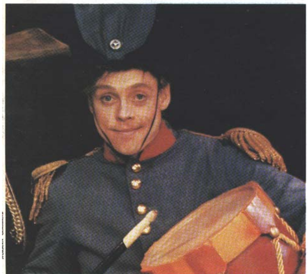
Mark Hamill as Tony Hart in "Harrigan 'n Hart"

The personal reviews were not enough to overcome some Broad-